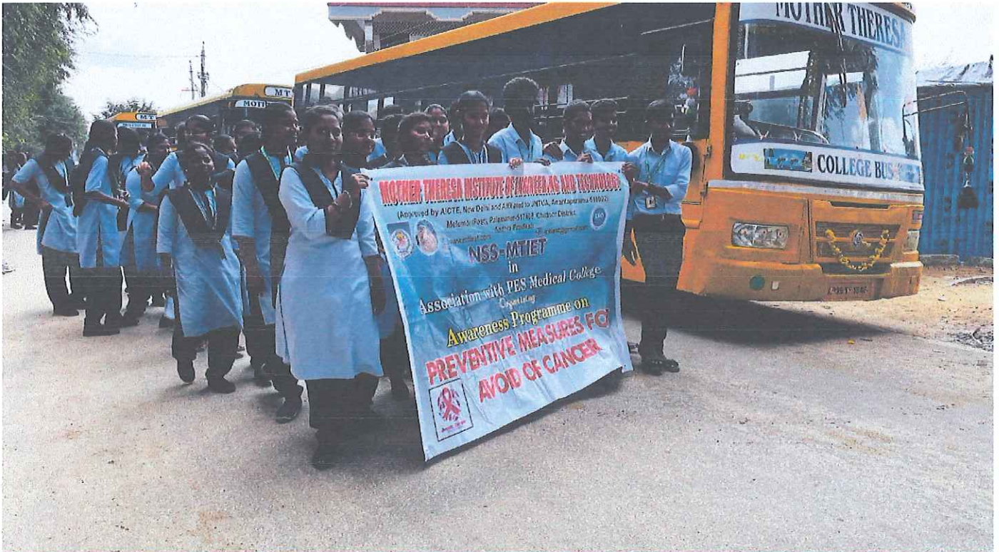
STUDENTS PARTICIPATED IN RALLY @ CANCER AWARENESS PROGRAM