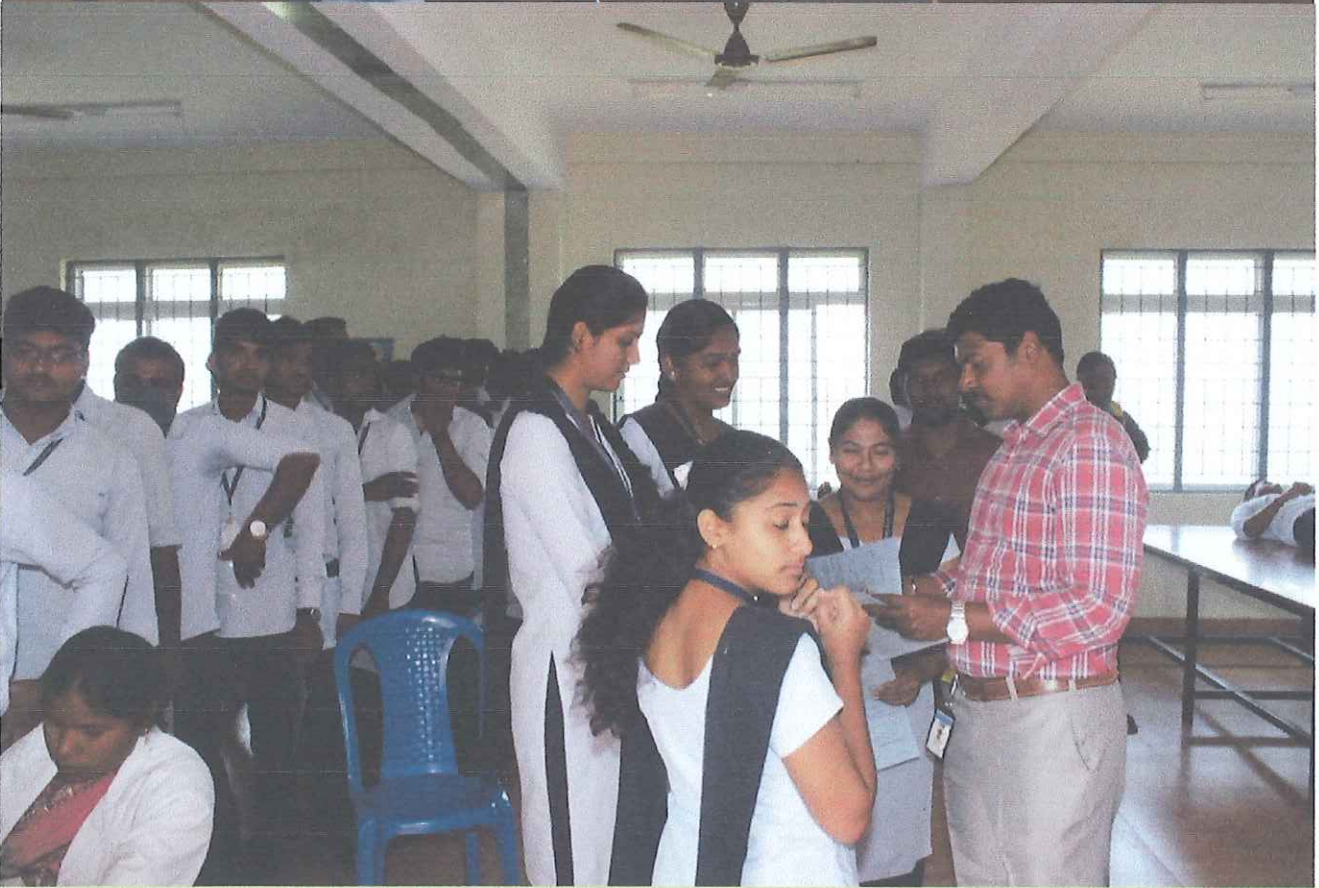
STUDENTS REGISTERING & DONATING BLOOD @ BLOOD DONATION CAMP – 14/06/2022