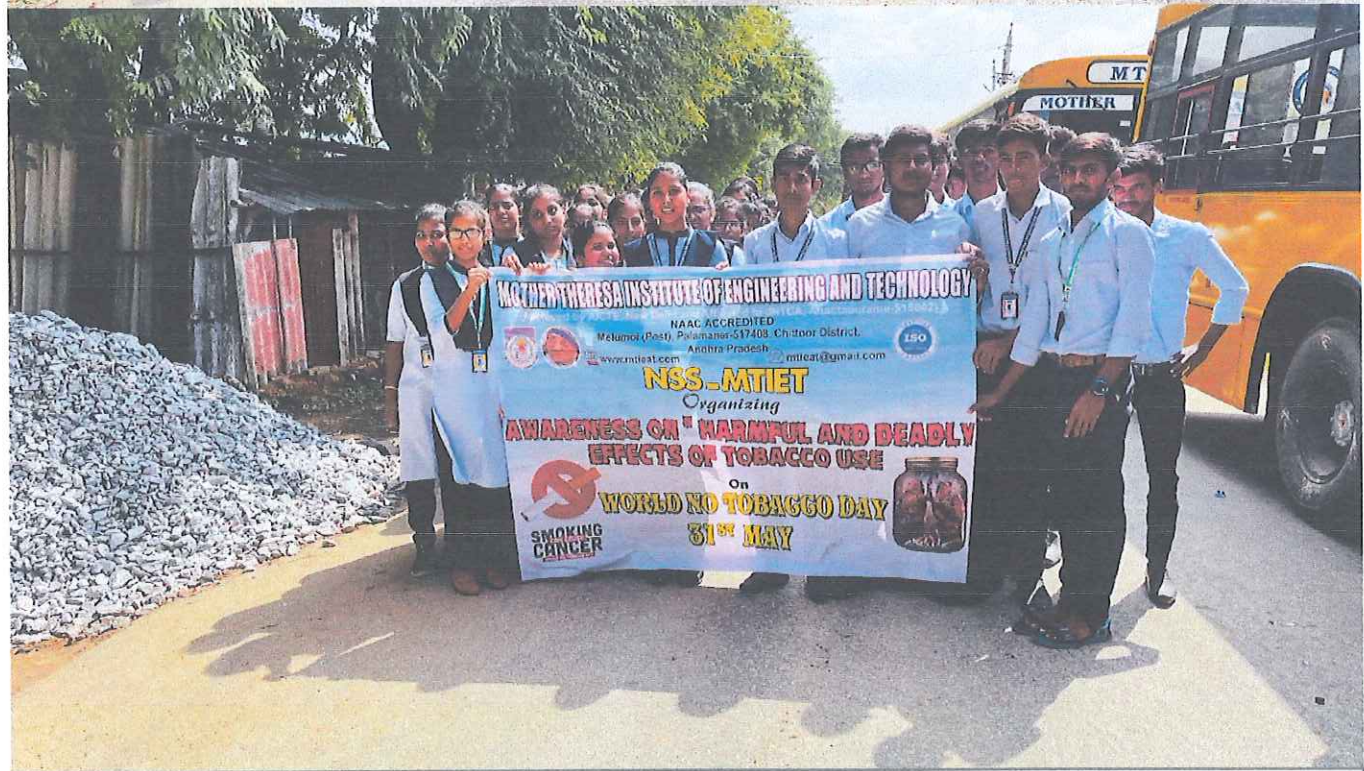
STUDENTS PARTICIPATED IN RALLY @ AWARENESS ON EFFECTS OF TOBACCO USE