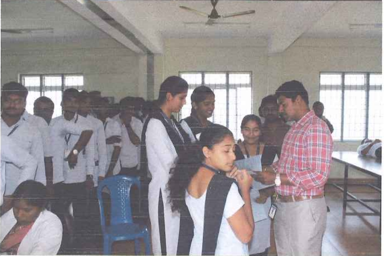
STUDENTS REGISTERING & DONATING BLOOD @ BLOOD DONATION CAMP - 06/02/2020