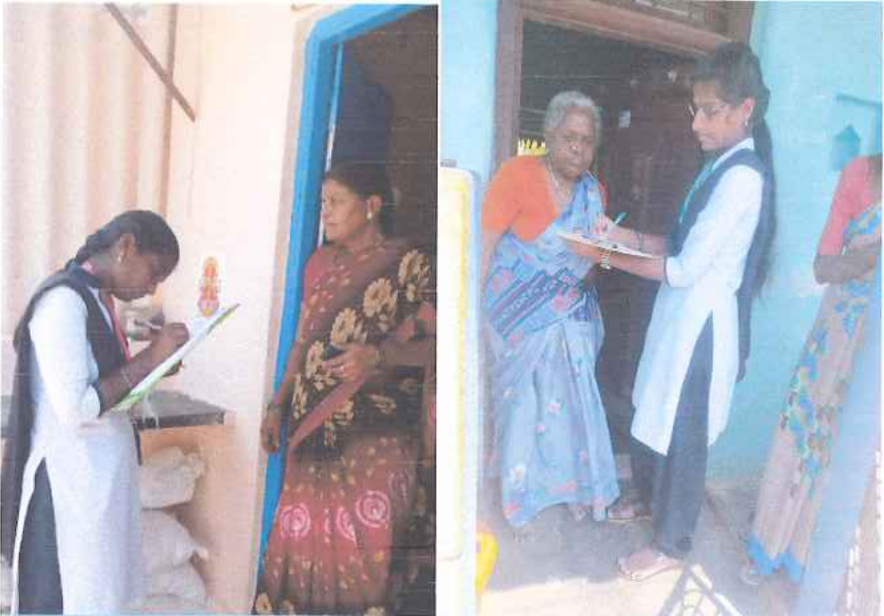
STUDENTS COLLECTING HOUSE HOLD DATA IN ADOPTED VILLAGE @ "VILLAGE HOUSE HOLD SURVEY. IN KEELAPATLA" - 21/12/2019