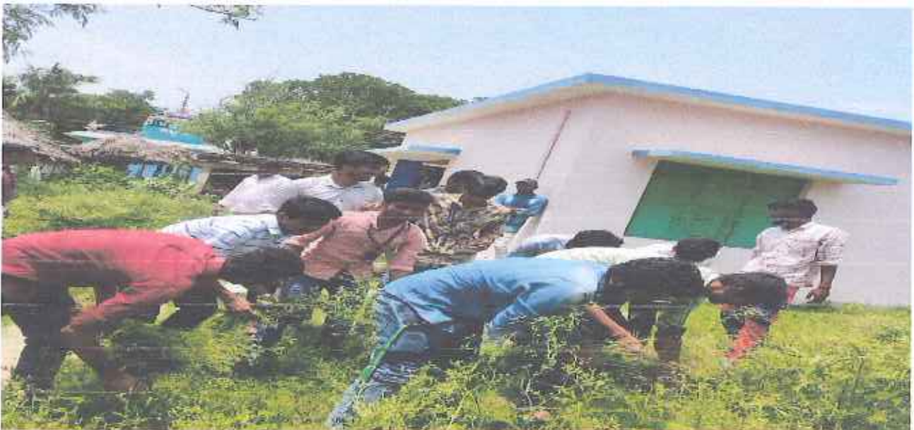
FACULTY & STUDENTS CLEANING @ SWACHH BHARATH ABHIYAN - 22/11/2019