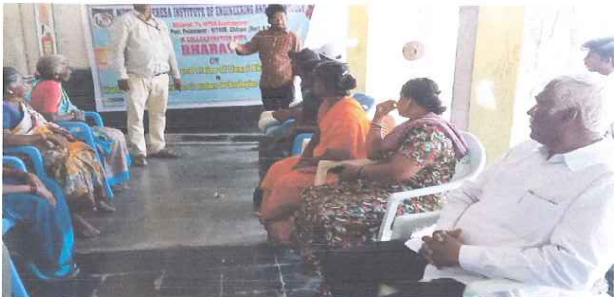
FACULTY CO-ORDINATORS INTACTION WITH THE VILLAGERS OF KEELAPATLA @ GRAMSABHA - 25/10/2019

The faculty members are undergone to a great discussion with the villagers to identify the problems in the village that can be solved technically. In this program 10 faculty coordinators & 90 students are actively participated to provide necessary requirements for the meeting.