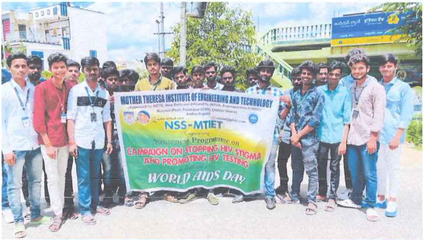
STUDENTS PARTICIPATED @ WORLD AIDS DAY