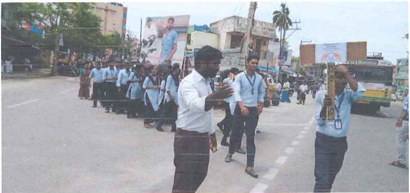
RALLY ON OCCASION OF NO SMOKING DAY