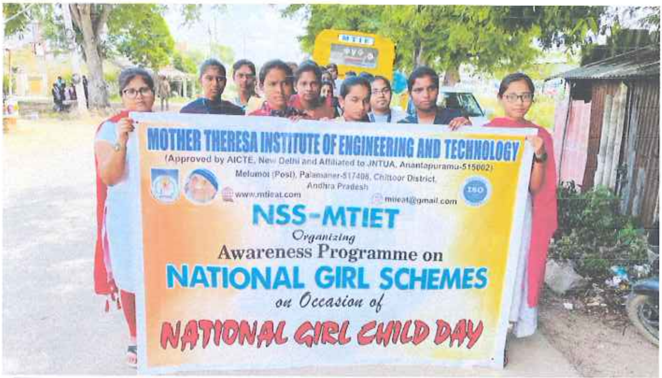
AWARENESS PROGRAM @ NATIONAL GIRL CHILD DAY