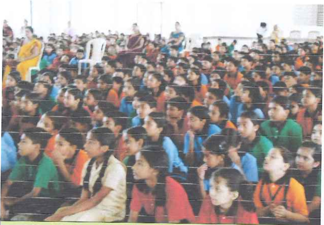
GIRL STUDENTS OF GOV HIGH SCHOOL @ "INTERNATIONAL WOMENS DAY PROGRAM"