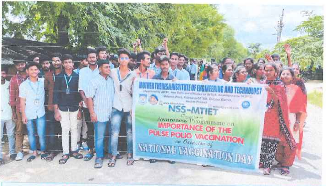
STUDENTS campaign in keelapalli village @ NATIONAL VACCINATION DAY