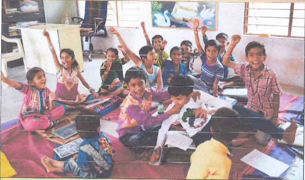
STUDENTS CREATING AWARENESS TO VILLAGERS @ NATIONAL GIRL CHILD DAY OF INDIA