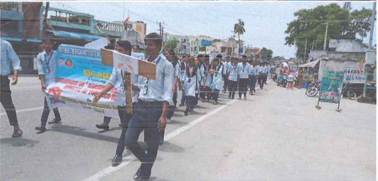
STUDENTS PARTICIPATED IN RALLY @ AWARENESS ON HARMFUL AND EFFECTS OF TOBACCO USE ON WORLD NO TOBACCO DAY