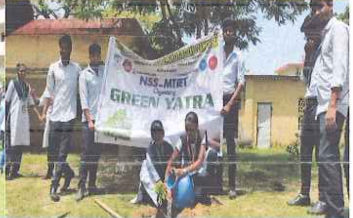
STUDENTS PLANTING TREES IN KALAGATOOR & MELUMOI VILLAGES @ GREEN YATRA PROGRAM

[Signature] CO-ORDINATOR (NSS - MTIET) 29/3/16 (N.V. KISHORE KUMAR)