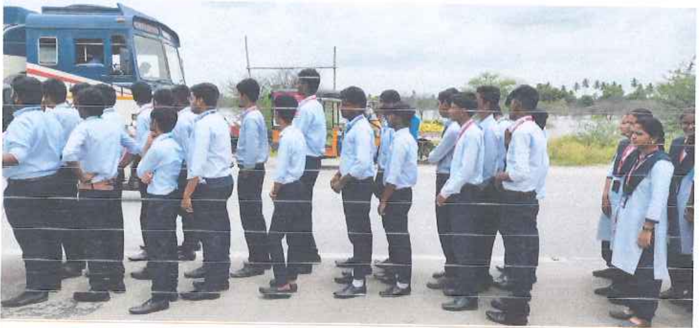
RALLY BY STUDENTS ON NO SMOKING DAY