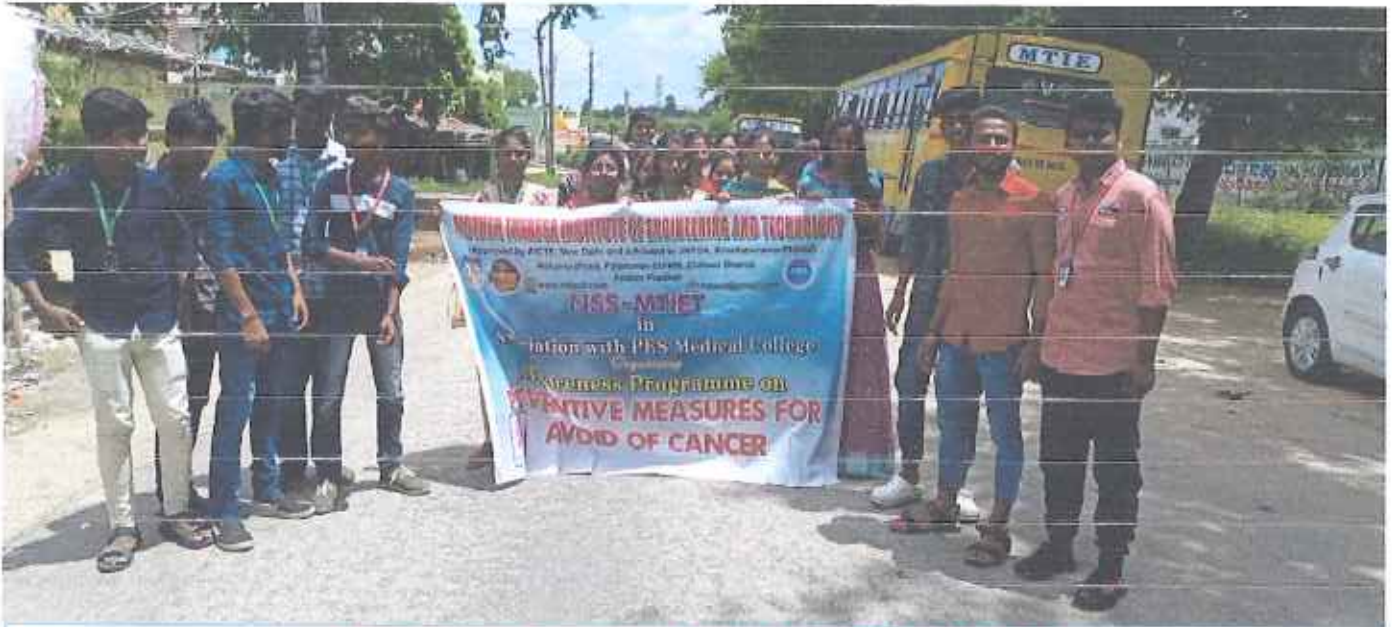
STUDENTS AT CANCER AWARENESS PROGRAM