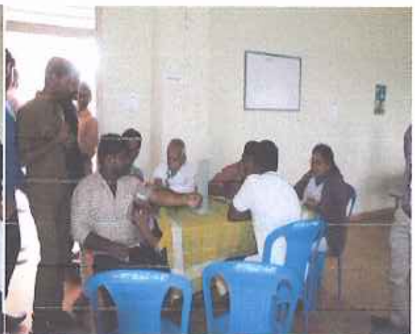
STUDENTS DONATING BLOOD @ BLOOD DONATION CAMP - 24/01/2018