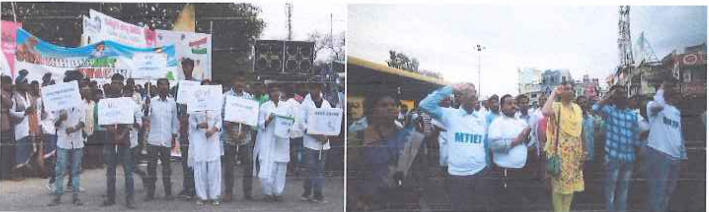
ZILLA SWACHH BHARATH PRERAK CHITTOOR (ZSBP) program in the "CHITTOOR" – 19-09-2017