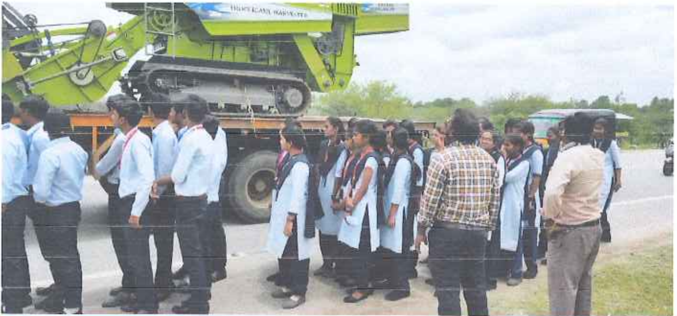
STUDENTS CONDUCTING RALLY @ NATIONAL VOTERS DAY