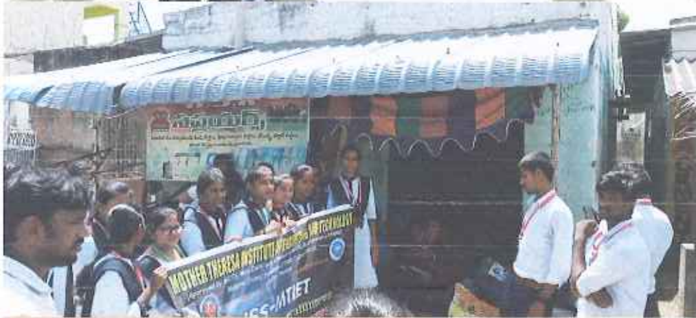
STUDENTS INTERACTING WITH THE VILLAGERS @ AWARENESS ON CYBER CRIMES & CYBER SECURITY – 30/01/2019