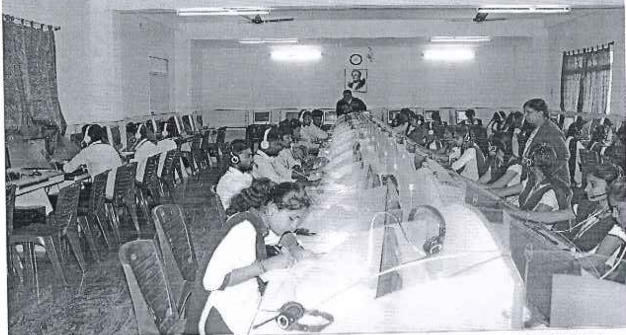
PRACTICAL SESSION @A POLICY TO IMPROVE SPEAKING SKILLS OF NON-NATIVE SPEAKERS