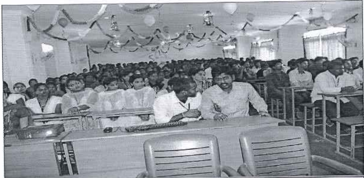
STUDENTS PARTICIPATION IN THE SEMINAR - RENEWABLE AND NON-RENEWABLE ENERGY RESOURCES

The total program was successfully completed with the cooperation of each and every faculty member of the department and student participants.