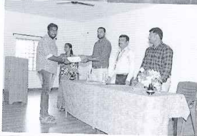
CERTIFICATE DISTRIBUTION BY HOD SIR @ E TAB SOFTWARE

BBC-0 Asat Head of the Department 4/11/17 HEAD OF THE DEPT. Civil Engineering Mother Theresa Inst. of Engg. & Tec PALAMANER - 517 402