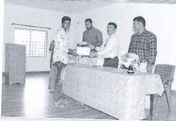
CERTIFICATE DISTRIBUTION PRINCIPLE SIR @ REVIT SOFTWARE

B.B.C.O. [Signature] Head of the Department 12/1/23