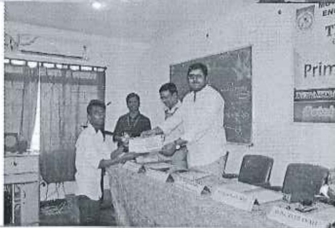
CERTIFICATE DISTRIBUTION BY CHAIRMAN SIR @ PLAXIS 3D SOFTWARE