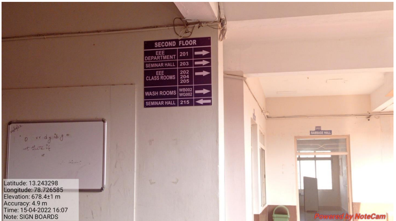
FLOOR WISE DIRECTION BOARD FACILITY IN THE INSIDE CAMPUS