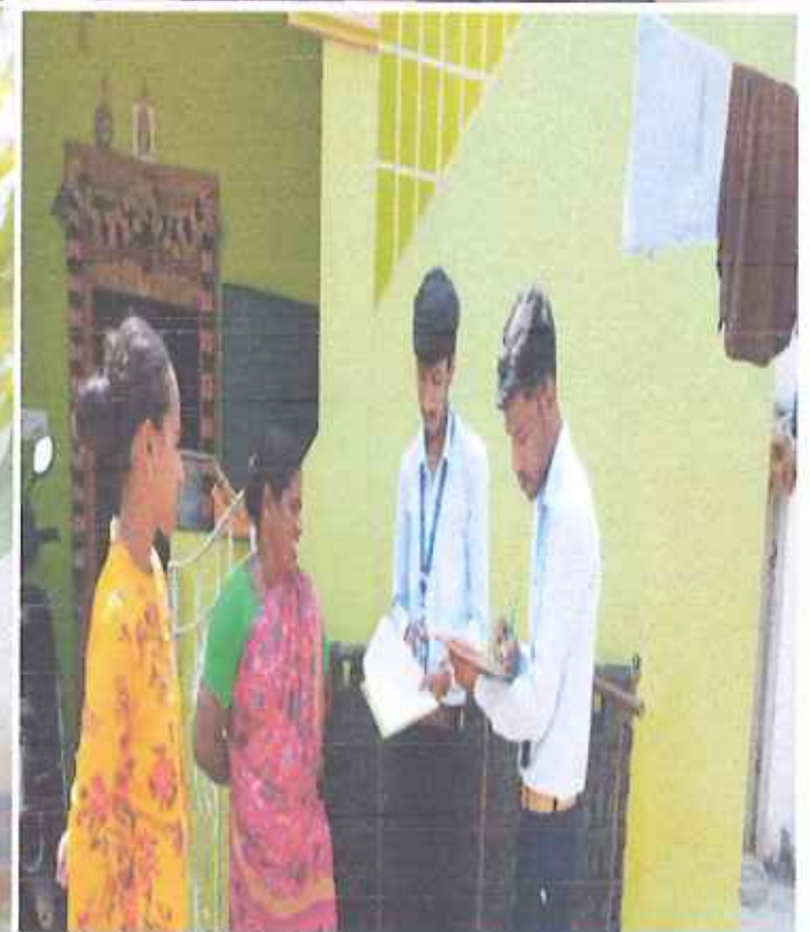
STUDENTS COLLECTING HOUSE HOLD DATA IN ADOPTED VILLAGE @ "VILLAGE HOUSE HOLD SURVEY, IN MELUMOI" – 20/01/21