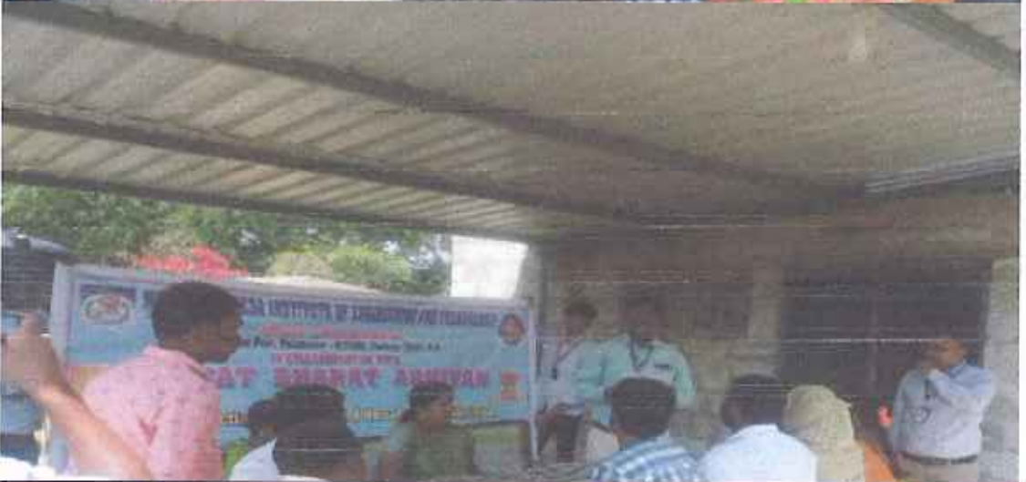
FACULTY CO-ORDINATORS INTACTION WITH THE VILLAGERS OF MELUMOI @ GRAMSABHA – 11/12/2020