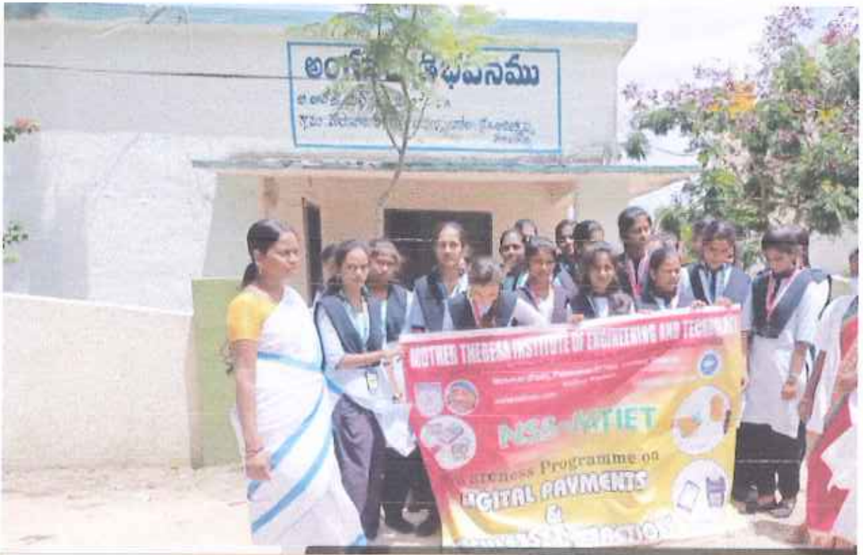
STUDENTS INTERACTING WITH THE VILLAGERS @ AWARENESS ON DIGITAL PAYMENTS & CASHLESS TRANSACTIONS - 09/11/2020