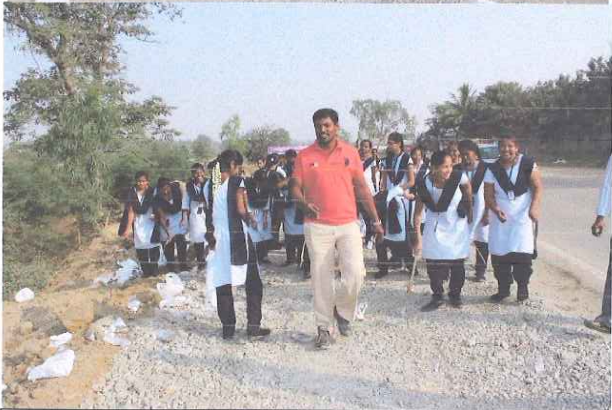
STUDENTS & PHYSICAL DRECTOR CLEANING THE PREMICES @ SWACHH BHARATH MISSION – 22/08/2018