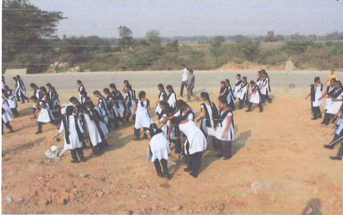
STUDENTS CLEANING THE SCHOOL & ROAD PREMISES IN MELUMOI @ SWACHH BHARATH MISSION – 22/08/2018