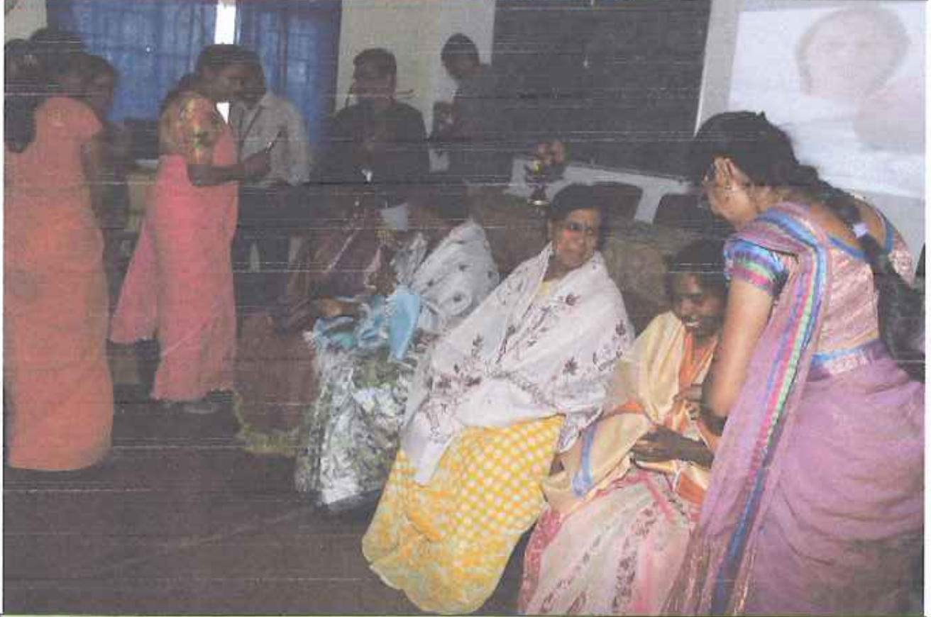
FELICITATION OF SENIOR LADY FACULTY BY LADY FACULTY & GIRL STUDENTS @ "INTERNATIONAL WOMENS DAY PROGRAM" – 08/03/2019