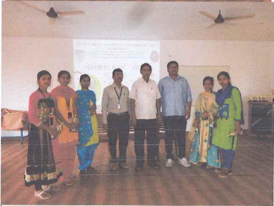
CHAIRMAN, ACADEMIC DIRECTOR & PRINCIPAL WITH THE PIZE WINNERS @ "SPORTS DAY 2k19" - 17/04/2019