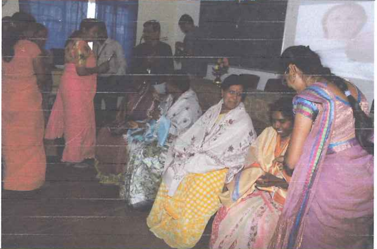
FELICITATION OF SENIOR LADY FACULTY BY LADY FACULTY & GIRL STUDENTS @ "INTERNATIONAL WOMENS DAY PROGRAM" - 08/03/2019