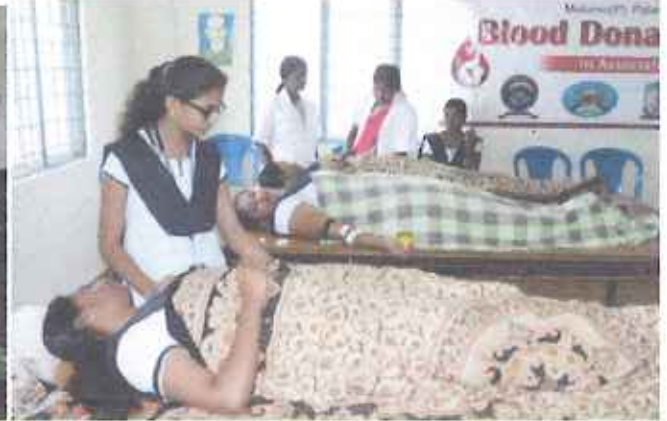
STUDENTS REGISTERING & DONATING BLOOD @ BLOOD DONATION CAMP – 25/01/2019