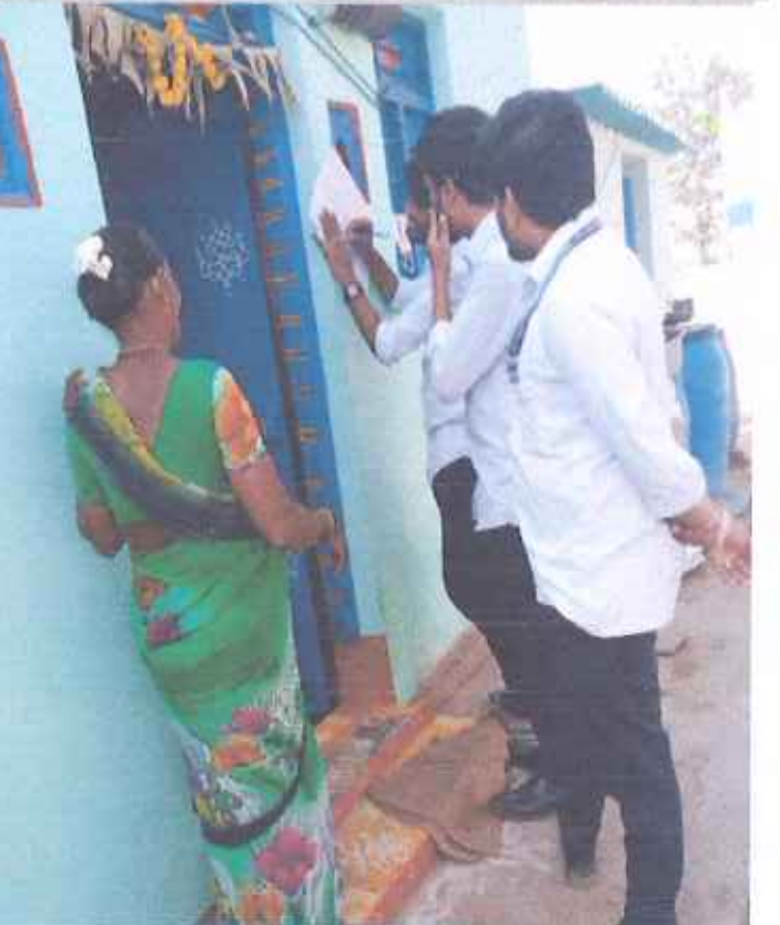
STUDENTS COLLECTING HOUSE HOLD DATA FROM THE ADOPTED VILLAGE @ HOUSE HOLD SURVEY PROGRAM, KALLUPALLI – 12/04/2018