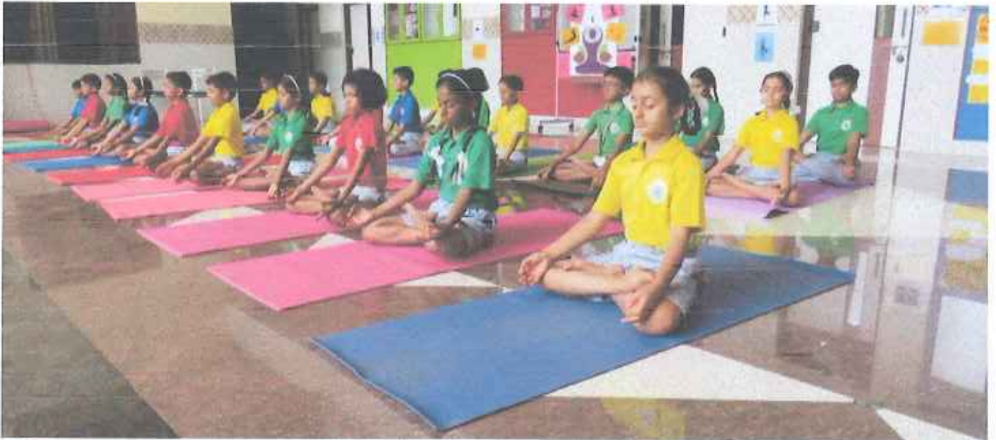
STUDENTS PRACTICING YOGA ASANAS @ "INTERNATIONAL YOGA DAY"

Heartfelt thanks to our Prime Minister, Mr. Narendra Modi for giving an opportunity for Colleges to celebrate the International Yoga Day. The College is also thankful to NSS UNIT OF MTIE for initiating this under them, also for inculcating Yoga as a part of the daily life.