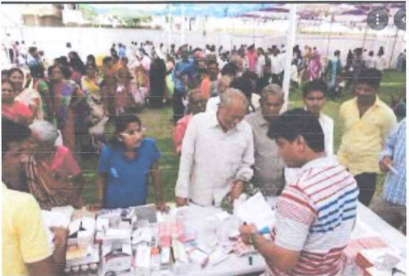
Medicines distributed to patients @ free medical camp