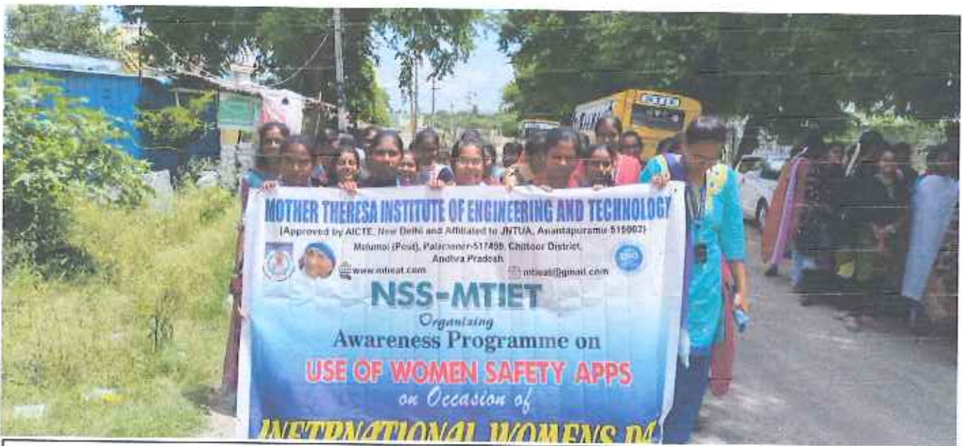
STUDENTS RALLY @ INTERNATIONAL WOMENS DAY