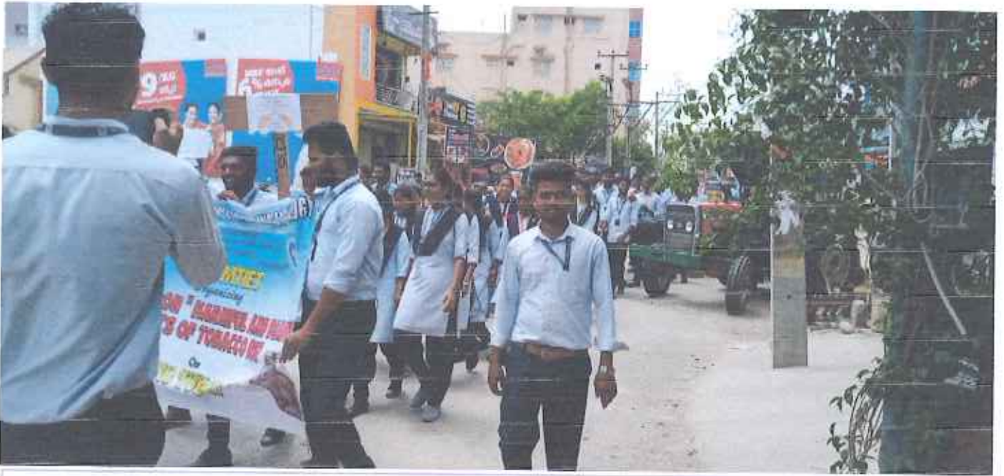
STUDENTS PARTICIPATED IN THE RALLY @NO SMOKING DAY