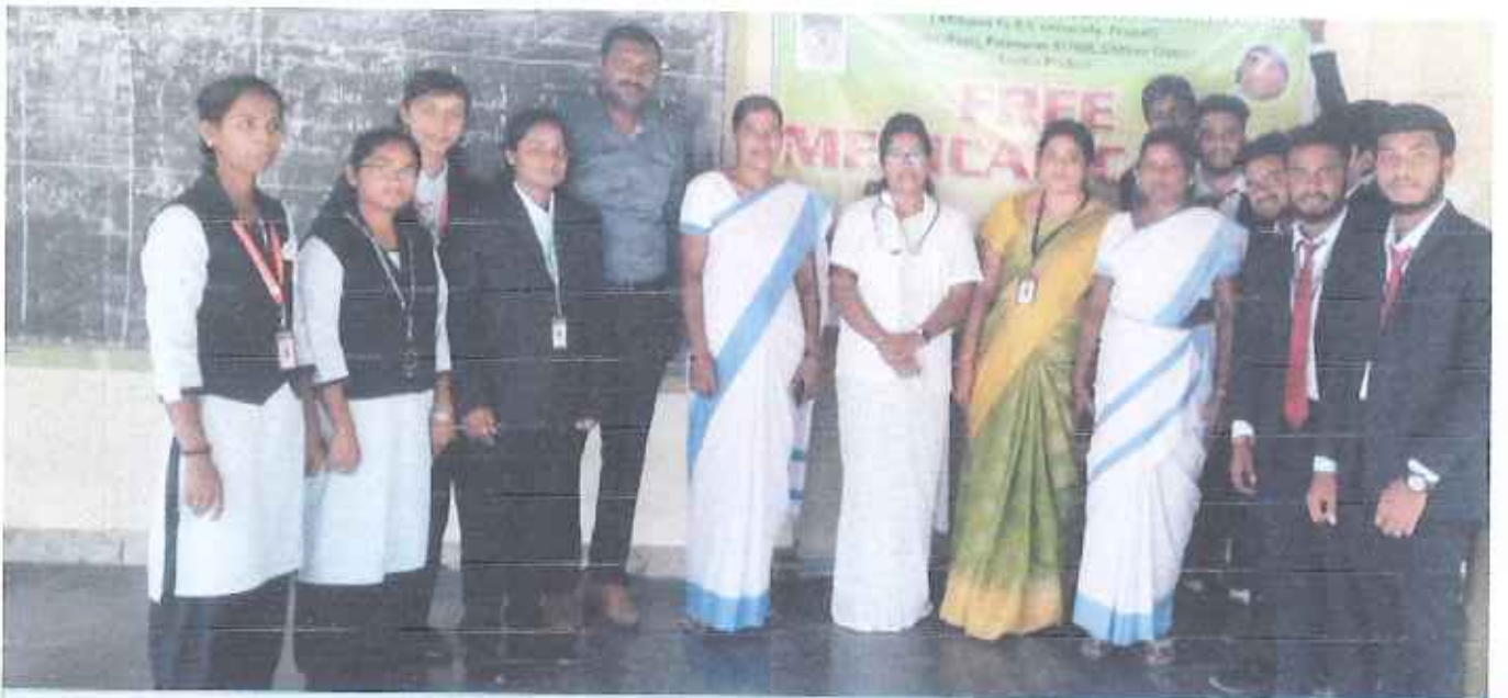
STUDENTS OF MTIET@FREE MEDICAL CAMP