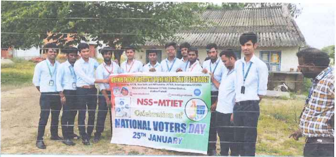
AWARENESS PROGRAM @ NATIONAL VOTERS DAY