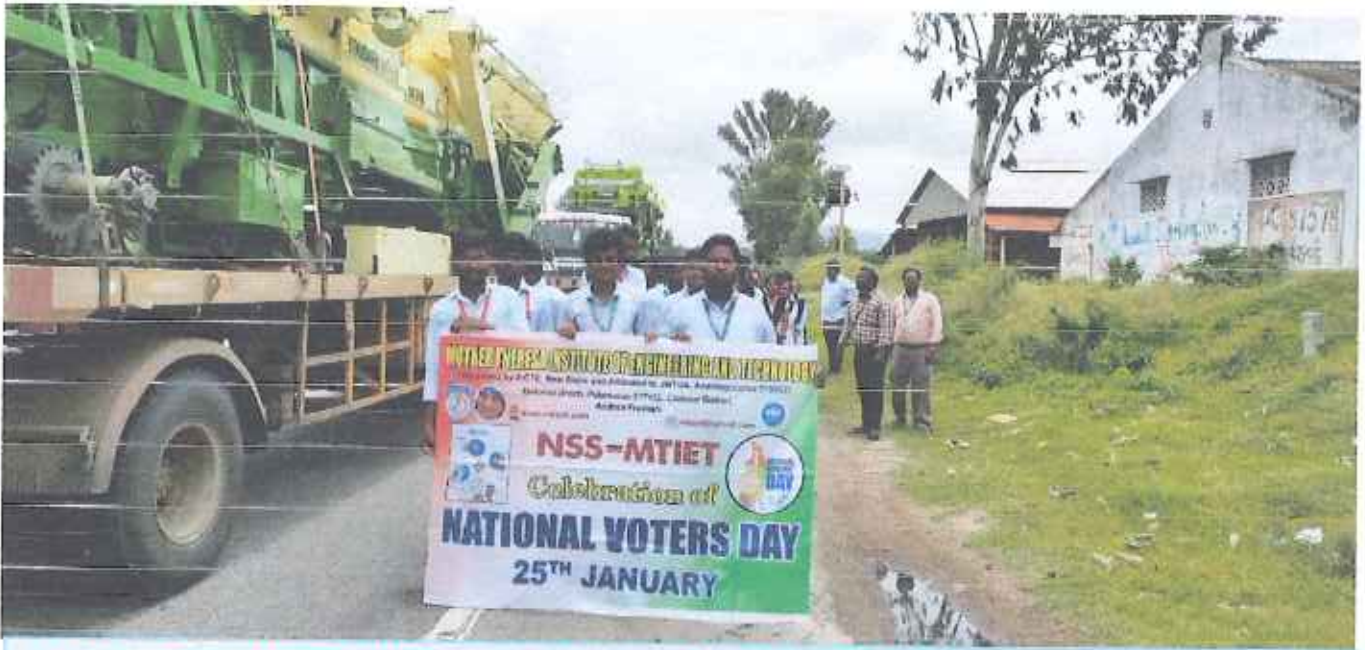
RALLY CONDUCTED BY THE STUDENTS INGANGAVARM @ NATIONAL VOTERS DAY