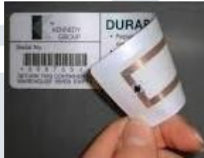
Fig: RFID tag

It is an electronic tag that has the ability to exchange the data with a RFID reader by means of radio waves. Most of the reader sends the signals to the tag using an antenna in an active RFID system. The tags receive the information along with the information with its memory, the reader receives the signals and for further processing the signals is transmits to the processor.