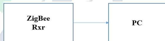
Fig c: Billing side