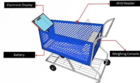
Fig 1: An Intelligent Trolley based on RFID