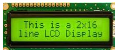
Fig: 16x2 LCD

LCD is a technology that can be used for displays in notebook and other computers. It is the combination of two states of matter, the solid and the liquid. In general, the LCDs are used for displaying the output, while this screen utilizes liquid crystals to create a picture. In this intelligent trolley we are making use of an LCD i.e. 16x2 which means it consists of 16 characters per line and there are 2 lines and in LCD each character is display in pixel matrix of 5x7.