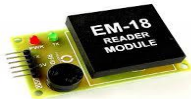
Fig: RFID reader

The radio frequency identification or RFID is a technology that will be works on radio frequency of radio waves. RFID reader is a device used for gathering the information from an RFID tag used for tracking the individual objects and the radio waves are used to transfers the data from tag to a reader and it is the technology which is similar to bar codes. So, whenever an object is in the range of the reader which has the ability to scan and read the code which is present in the binary form that can be present on an RFID tags which are